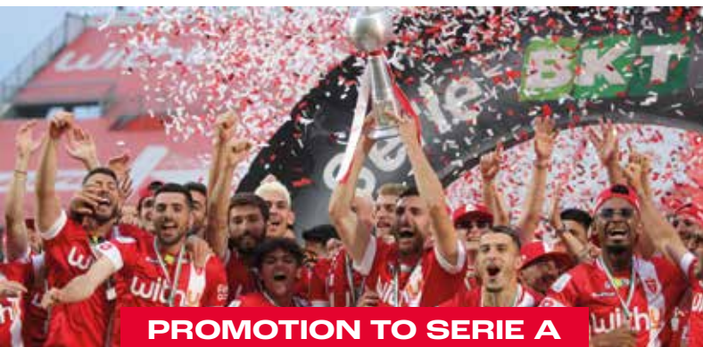
PROMOTION TO SERIE A