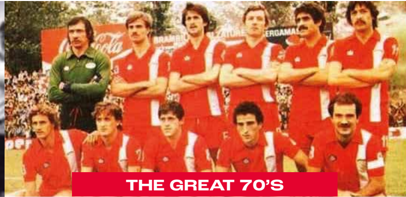
THE GREAT 70'S