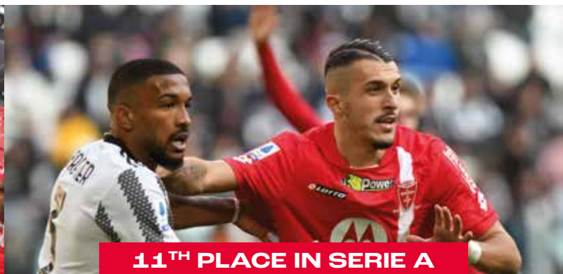
11 TH PLACE IN SERIE A