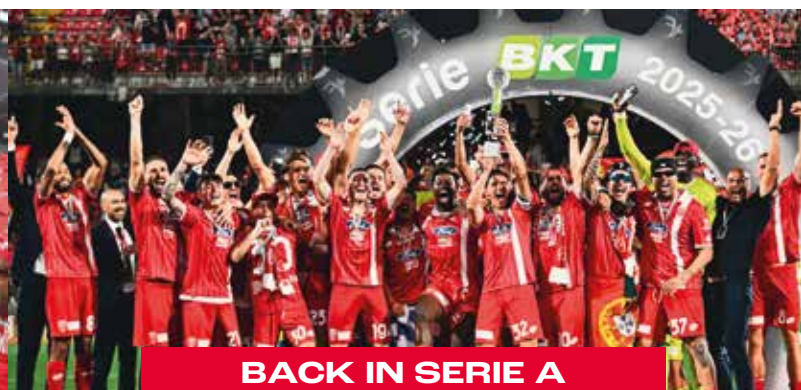
BACK IN SERIE A